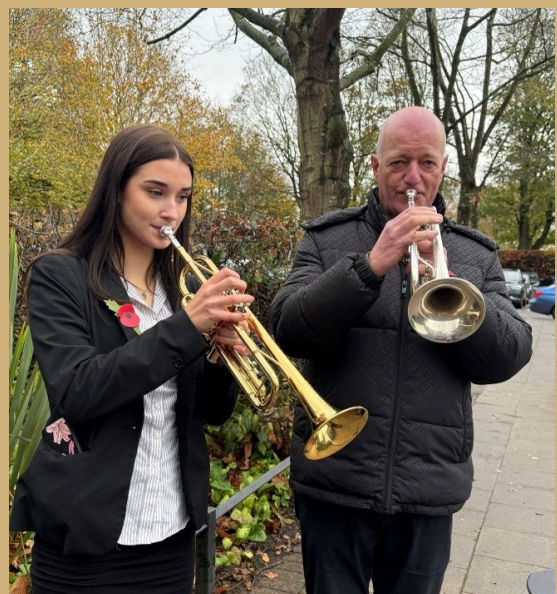
The Last Post was played around school on Tuesday 11th November.

Two lives cruelly cut short and a family left shattered. We will remember them.